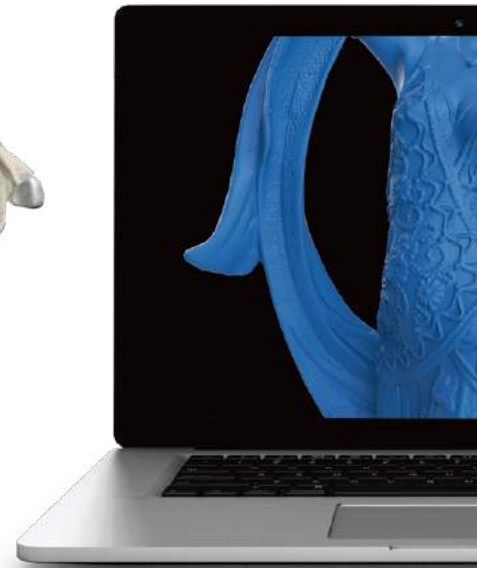
Handheld HD Scan Mode